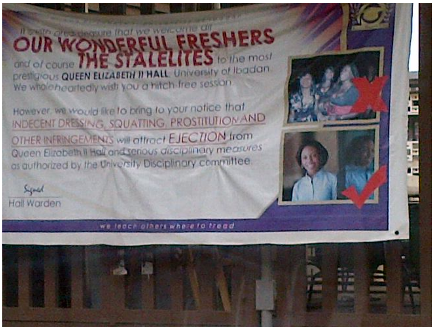
Figure 3: Poster on Indecent Dressing at A Female Hall of Residence, University of Ibadan

The University of Ibadan on the other hand, does not have a published dress code but "encourages a 'dress sense' culture among males and females" (see Figure 3). In the University of Ibadan Sexual Harassment Policy , forms of sexual harassment in the University include: "Seductive postures and indecent dressing and exposure by males or females that offend public morality. Any form of dressing that exposes vital parts of human body constitutes indecent dressing". (University of Ibadan Sexual Harassment Policy, 2012; 13). Besides, the Vice chancellor while addressing the matriculants for the 2012/2013 session, "encouraged the matriculants to strive to be ...on the Vice-Chancellor's Rolls of Honour at the end of the session rather than engage in social vices like hooliganism, violence, cultism, prostitution and indecent dressing among others" (University Advancement Center, 2013).