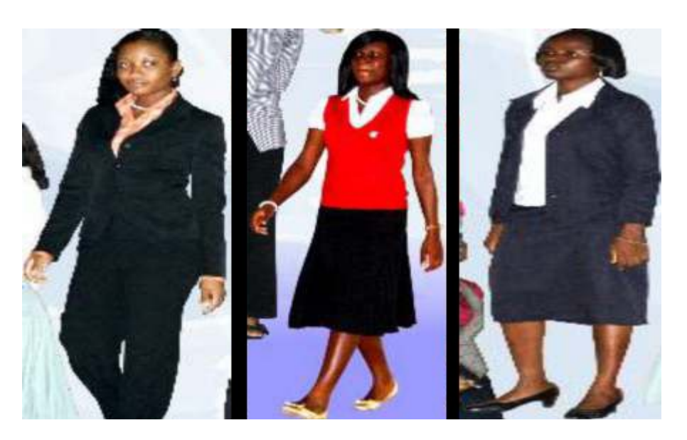
Figure. 1: Approved Dressing for Females Students in Covenant University