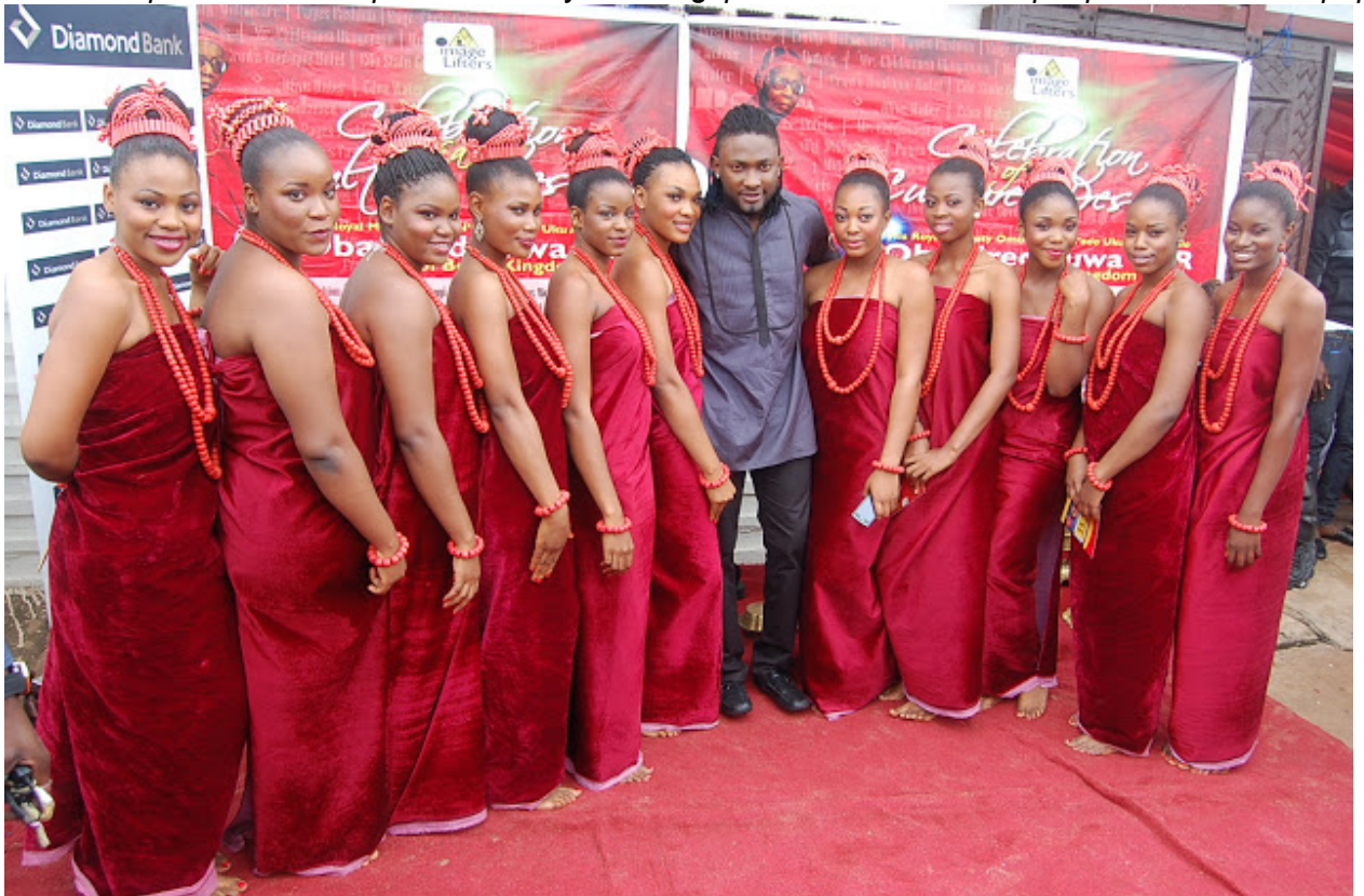
Figure 5: Edo Ladies dressed in traditional attire revealing their upper arms and chest