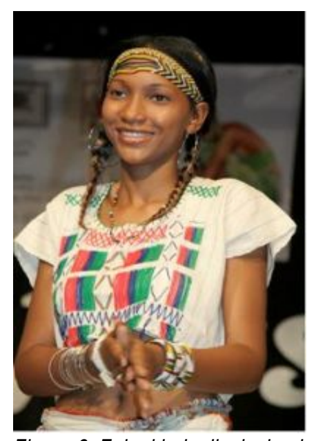
Figure 6: Fulani lady displaying her mid-rib