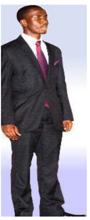
Figure 2: Approved Dressing for Male Students in Covenant University

Similarly, the Universities of Lagos in its Campus News (Vol 15, No 45) reported that Senate approved the following dress code for University of Lagos students which stipulated that students are not allowed to wear: