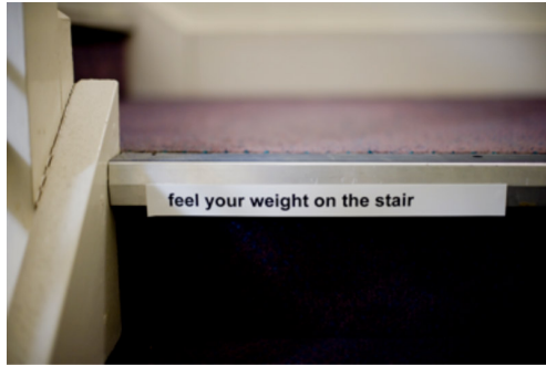
Marking Presence