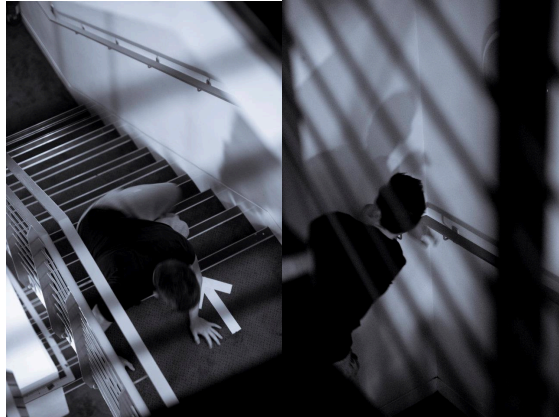
Marking Presence